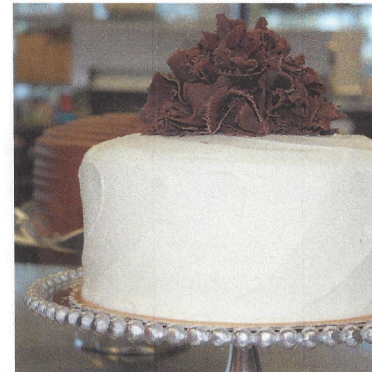
As featured on the Food Network and in Oprah Magazine